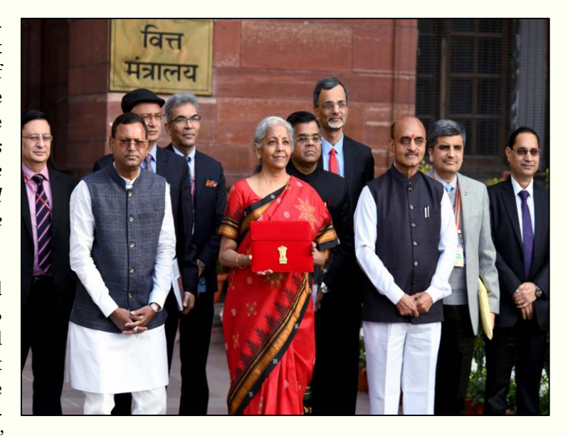
Union Minister of Finance and Corporate Affairs Smt. Nirmala Sitharaman presented the Union Budget 2023-24

The Finance Minister proposed to increase capital investment outlay for the third year in a row, by 33% to ₹ 10 lakh crore , which would be 3.3% of GDP and almost three times the outlay in 2019-20. The direct capital investment by the Centre is complemented by the provision for creating capital assets through Grants-in-Aid to States and this " Effective Capital Expenditure " of the Centre would be budgeted at ₹ 13.7 lakh crore i.e. 4.5% of GDP .