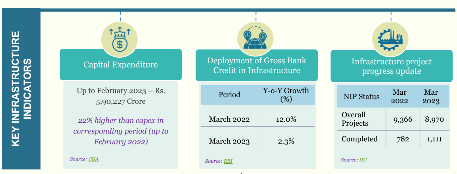
Page 2 of 8